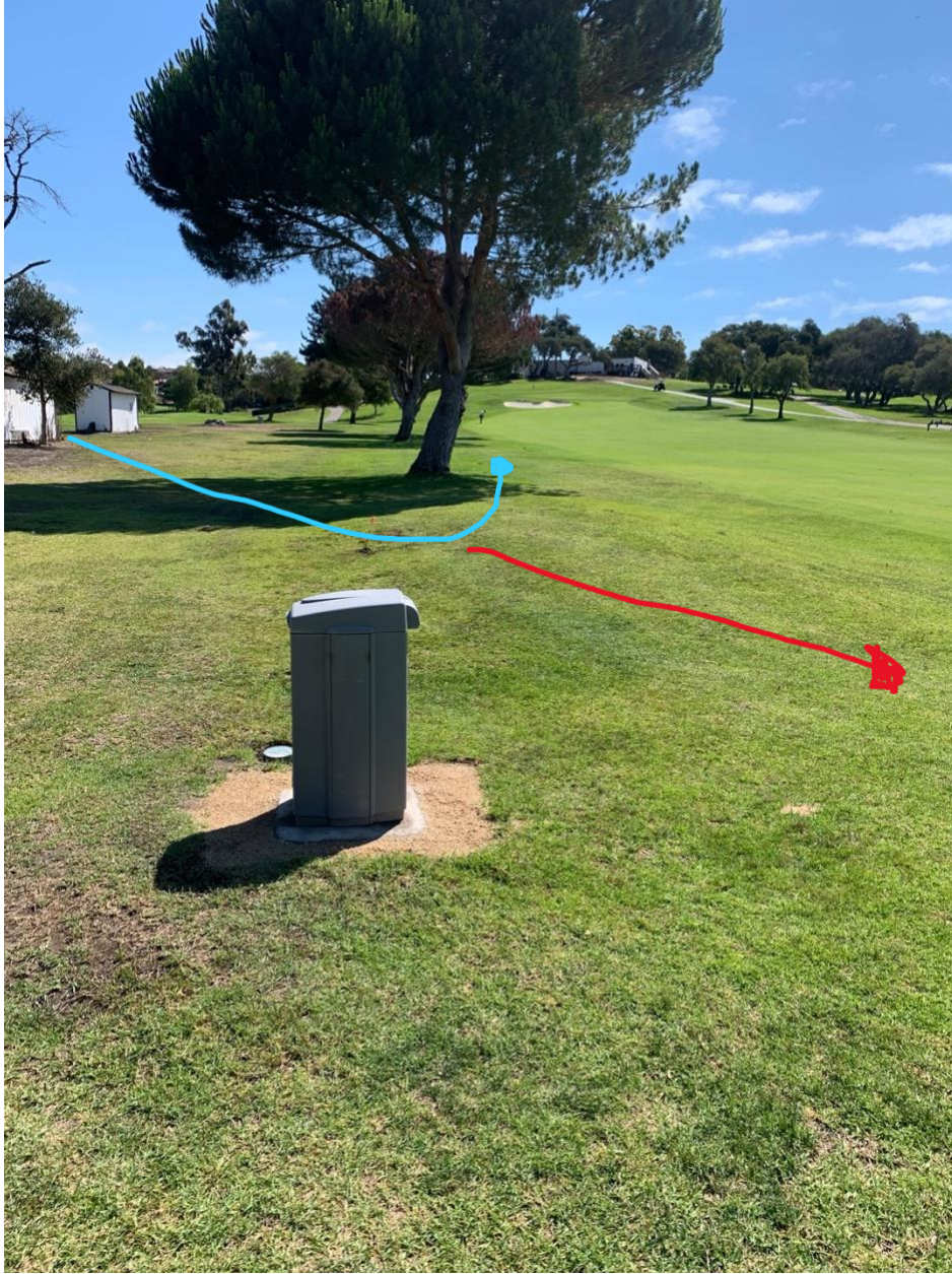
blue line going around to start another 1875m loop.