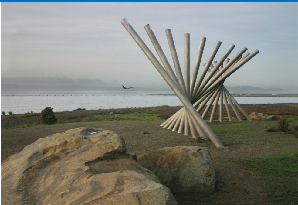
Oyster Bay Regional Shoreline