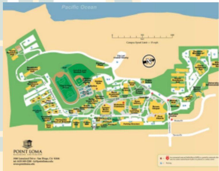
PLNU Sports Medicine Facility